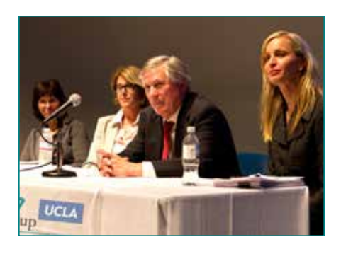
The Help Group-UCLA Autism Research Alliance Panel

If you have questions about continuing education, please contact events@thehelpgroup.org or call 818.779.5212