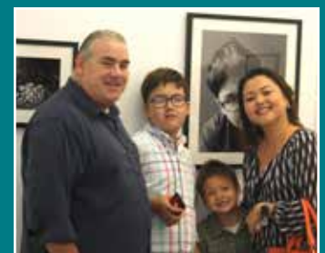
djng Gallery hosts multi-year project by students of The Help Group