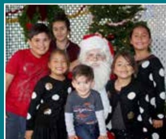
Annual Carnival delivers holiday cheer to hundreds of children and their families