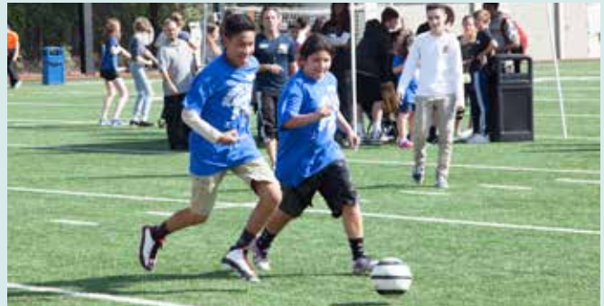
Help Group students enjoy a friendly game of soccer