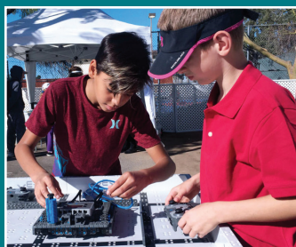
STEM 3 Academy’s 3rd Annual Very Special Innovation Fair Draws Big Crowd