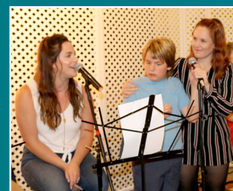
Featuring a selection of Broadway tunes and pop songs