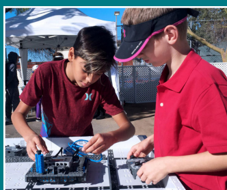
STEM 3 Academy's 3rd Annual Very Special Innovation Fair Draws Big Crowd